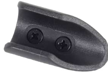
FAST FILLING DEVICE