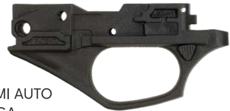
SHOTGUN TRIGGER PLATE