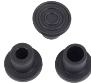
CHARGING HANDLE COVER